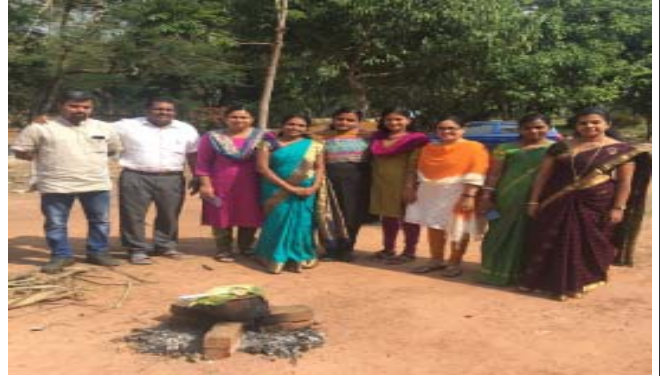
The participants of 150th OP celebrating 'Pongal'