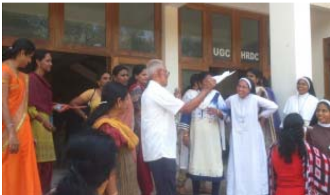
Teacher student in close observation - RC in Education and Teaching Methods practicals