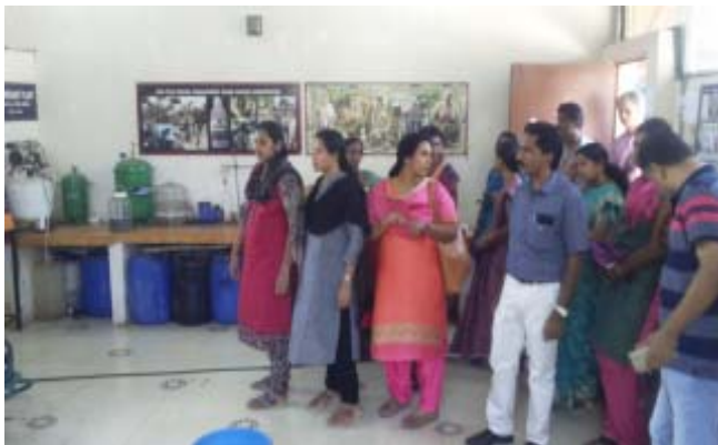
The participants of RC in Environmental Science in ISRO Explored!!