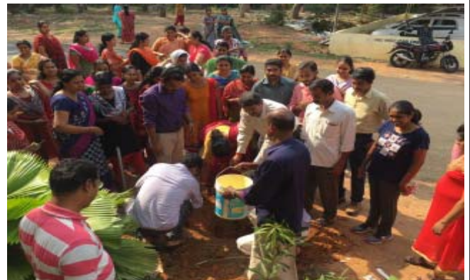
Tree planting - Director & the participants of 151st OP