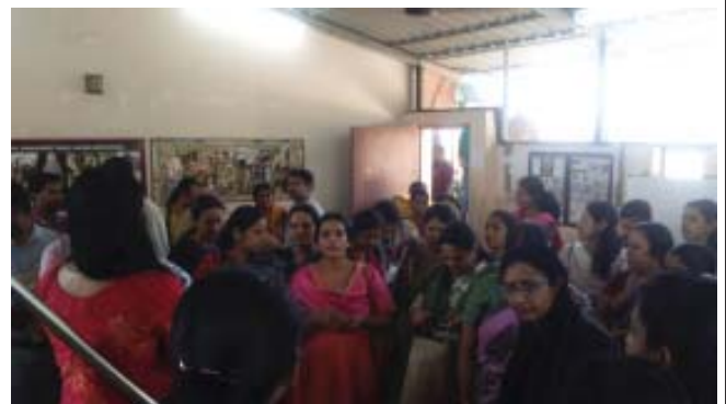
The participants of RC in Environmental Sciences visiting Central Tuber Crops Research Institute